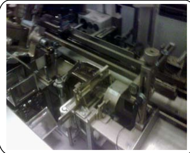
Layout of BA50

Size range A (mm) = 40 - 140 B (mm) = 20 - 100 C (mm) = 70 - 190